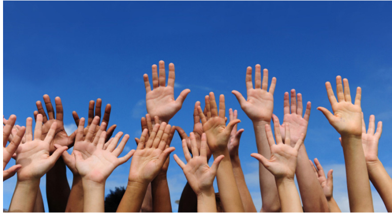
File Name: Hhero_Rally_880x475_2006048D.jpg