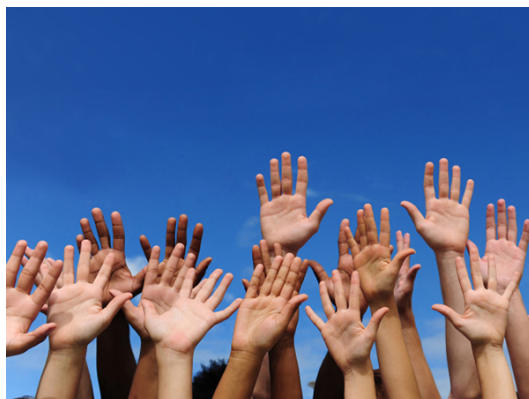
File Name: Feat-CTA_Rally_600x450_2006048D.jpg