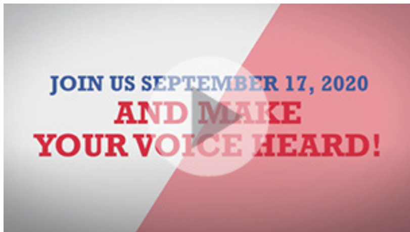
Image art for linking in emails or on website: 2006048D_20Rally_video_305x170.jpg