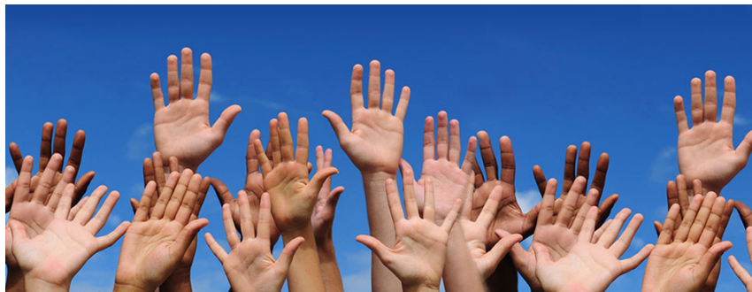
File Name: Phero_Rally_966x370_2006048D.jpg