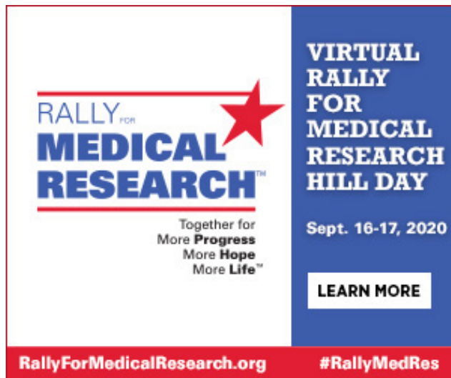
File Name: 2006048D_20Rally_300x250_1.jpg