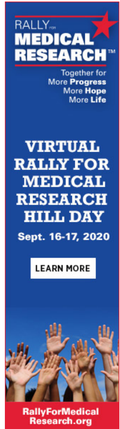
File Name: 2006048D_20Rally_160x600_ HILL.jpg